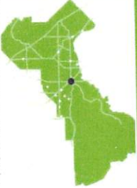
Fresno Housing Authority chose Sierra Pointe for its program throughout Fresno County including 21 developments in the City of Fresno.